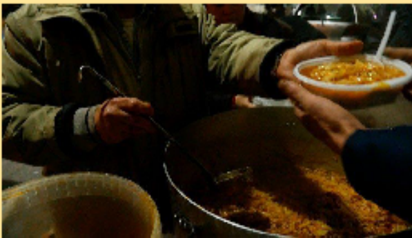
World Day of the Poor encourages closeness to those in need

It is in this spirit that an outstretched hand can be "enriched by the smile of those who quietly and unassumingly offer to help, inspired only by the joy of living as one of Christ's disciples." This also is the spirit that we are invited to live in this fourth World Day of the Poor.