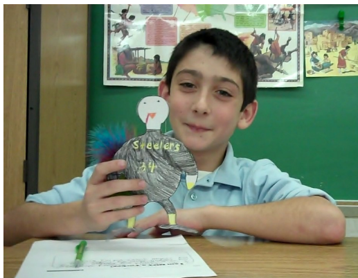
Turkeys in Disguise

If you are volunteering in our school you MUST attend a child protection in-service offered by the Diocese. All volunteers and coaches must also be fingerprinted, and have an FBI and BCI check. The next child protection in-service will be offered on December 12 at St. Paul North Canton from 6:30 to 8:30. Call 330.499.2201 x 327 to reserve a spot.